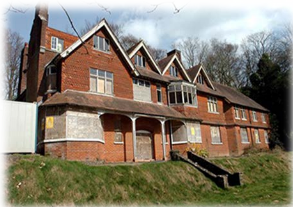
Figure 6. Before the renovation of Undershaw.

But eventually I began to be educated about Undershaw , by way of Mr. Sherlock Holmes. ( Read the complete story )